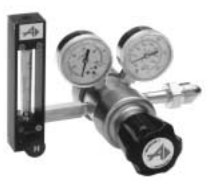
TSD Regulator with Flowmeter